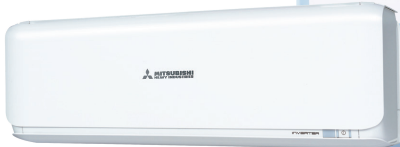
SRK20ZSX-W, SRK25ZSX-W, SRK35ZSX-W SRK50ZSX-W, SRK60ZSX-W