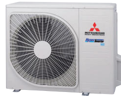
SRC20ZSX-W, SRC25ZSX-W, SRC35ZSX-W, SRC50ZSX-W1, SRC60ZSX-W1